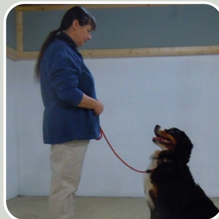
Obedience & Rally-O